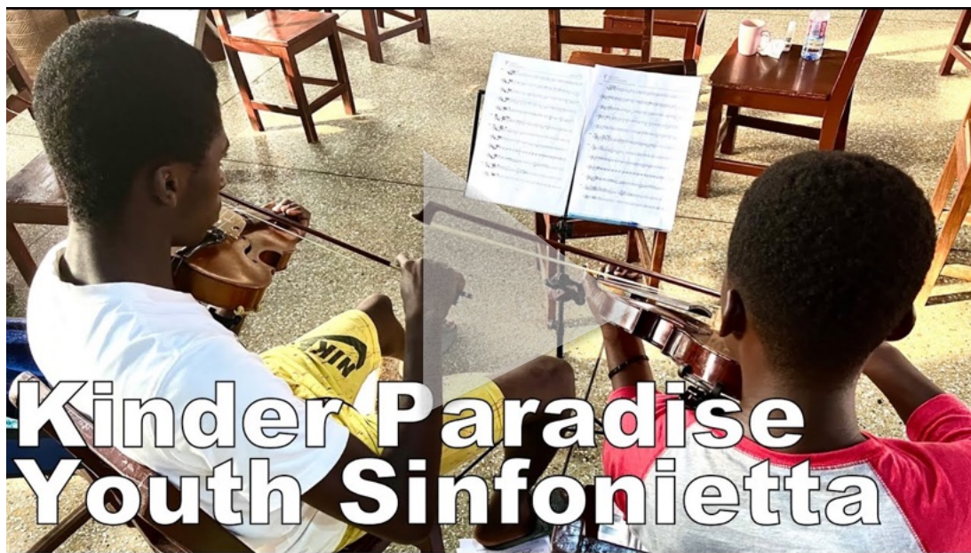
Kinder Paradise Youth Sinfonietta

In August 2023 Keys of Change held a music camp and performance. This event was enhanced by the presence of two visiting Keys of Change teachers, as well as the two music teachers based in Ghana long-term. Their collective expertise and dedication greatly contributed to the successful preparation and execution of the music camp, ensuring a memorable and rewarding experience for all involved.